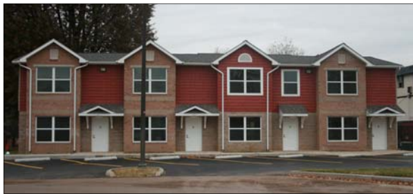
Phase II, CRH #2, is currently under construction and will create a total of forty-four new units at Orchard Manor, Littlepage Terrace and Washington Manor. Eight units were constructed at Washington Manor, twenty-two at Orchard Manor and fourteen at Littlepage Terrace.

The units pictured above are located beside Washington Manor. Charleston-Kanawha Housing had an open house for residents to tour one of these units on November 14, 2008. These units are almost fully occupied by residents being relocated for phase III of redevelopment which includes demolition of 120 units in Washington Manor and 46 in Littlepage Terrace.